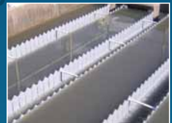
TROUGHS & LAUNDERERS

Over 40 years of excellence in engineering and fabricating composite flow moderation products. Plasti-Fab flow measurement products have a 25-year corrosion warranty.