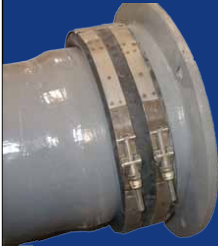
FLANGED FRP ENDS FOR BOLTING TO WALL