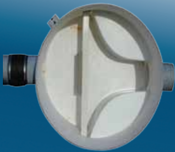
ENERGY ABSORBING MANHOLES